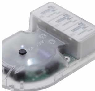
Retrofittable receiver, radio-controlled, with floor lighting system and relays