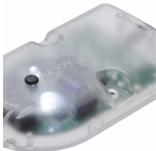
Retrofittable receiver, radio-controlled, with floor lighting system, without relays